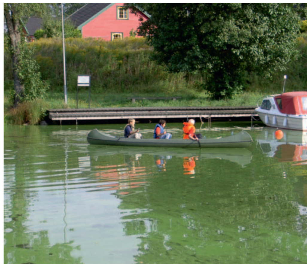
The western part of lake Vansjø has a very poor water quality due to algae blooms.

As some of the necessary measures may not be profitable, subsidies given to the farmers that implement the measures may be necessary for comprehensive implementation of mitigation measures.